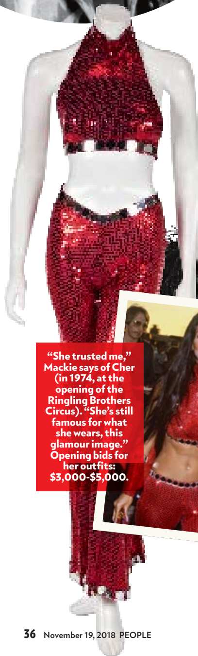
Cher wore this on her 1975-76 variety show.