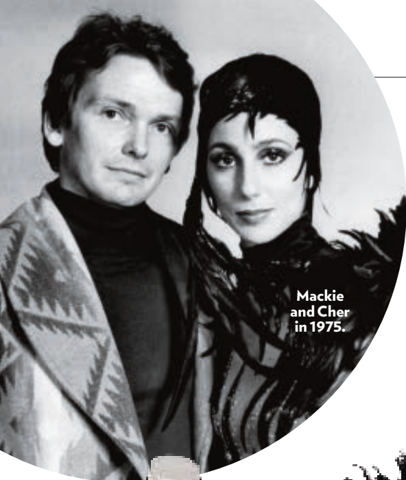
Mackie and Cher in 1975.