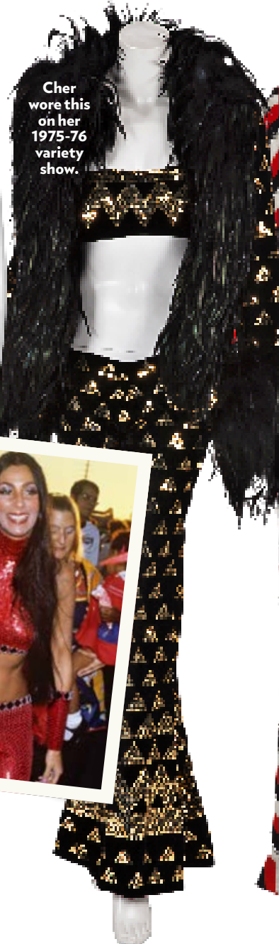
A plunging Cher show look.